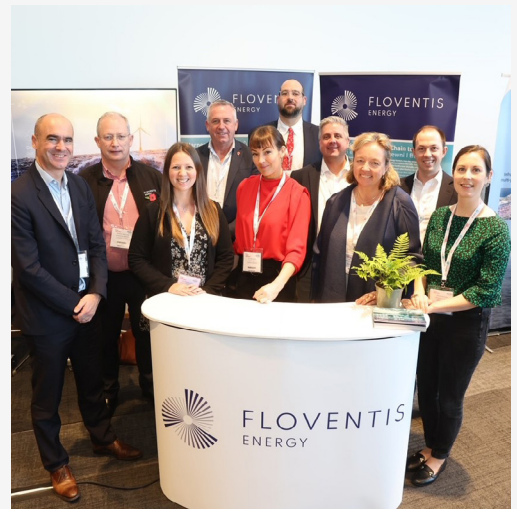
Floventis Team at Future Energy Wales Conference.