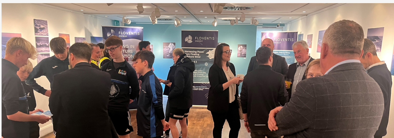
The Milford Youth Matters Dyfodol Launch.

Your views are important to help us better understand the local area and any potential impacts our scheme may have on you and your community. All responses to the public consultation will be recorded in a consultation report, which will form part of our applications for consent.