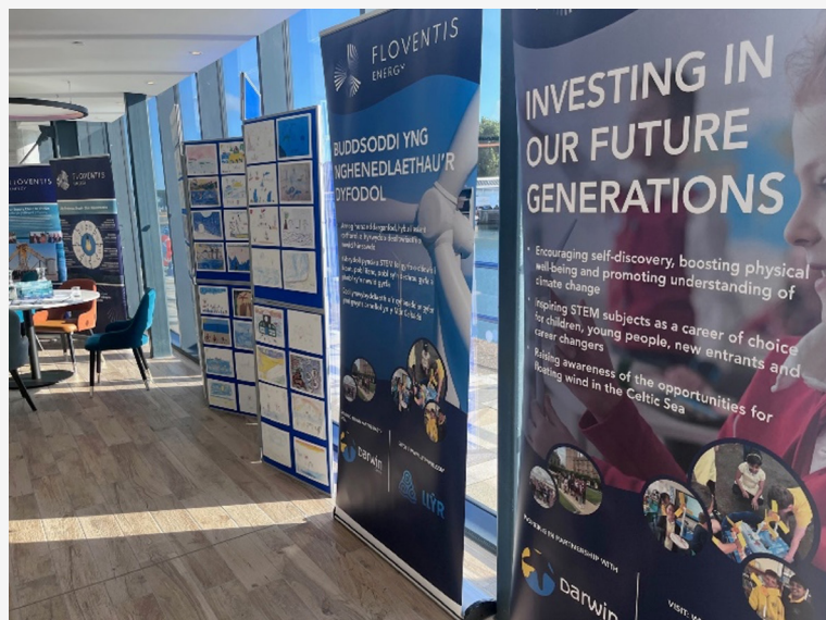
One of our Public Awareness Days at Ty Hotel.

This follows a series of Public Awareness Days that we held in July 2023, aimed at introducing our projects and raising awareness regarding our proposals to residents and interested parties across the region.